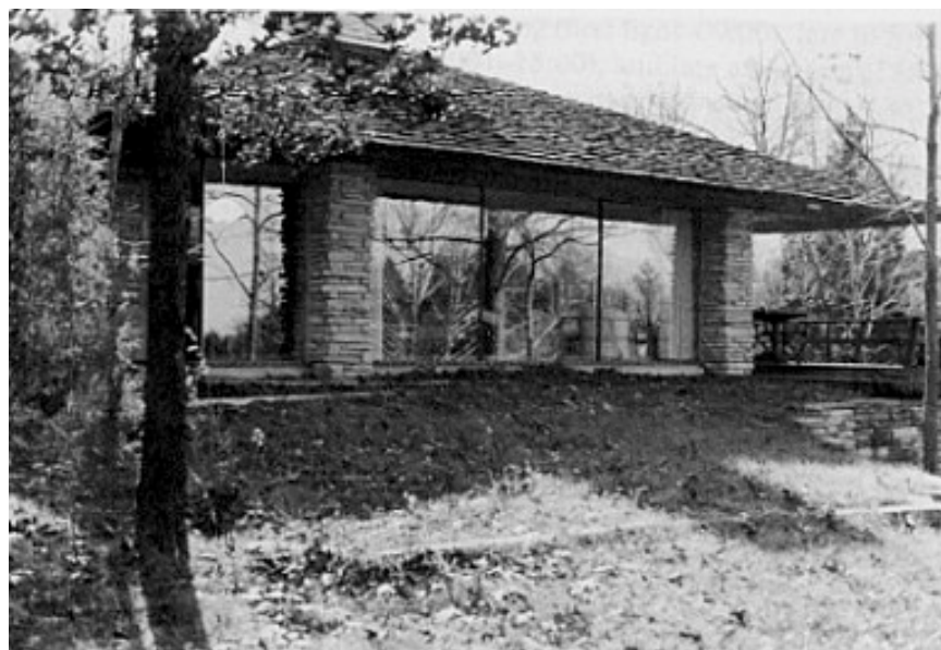
FIG. 4. Clear glass of Hayward house showing reflective effect.

Sparrow and a Dark-eyed Junco. Strikes at the mirror were probably minimal due to ice covering the surface during early morning hours throughout the experiment. These results indicate that windows need not be associated with man-made structures to kill birds.