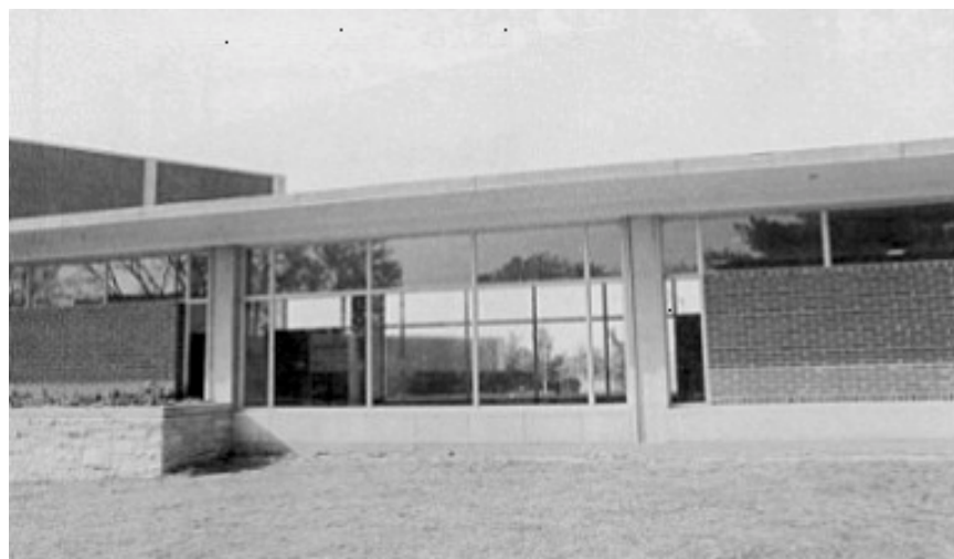
FIG. 3. Clear glass windows of a corridor showing see-through effect.

exception of certain severe conditions affecting visibility, strike rates are higher during favorable weather.