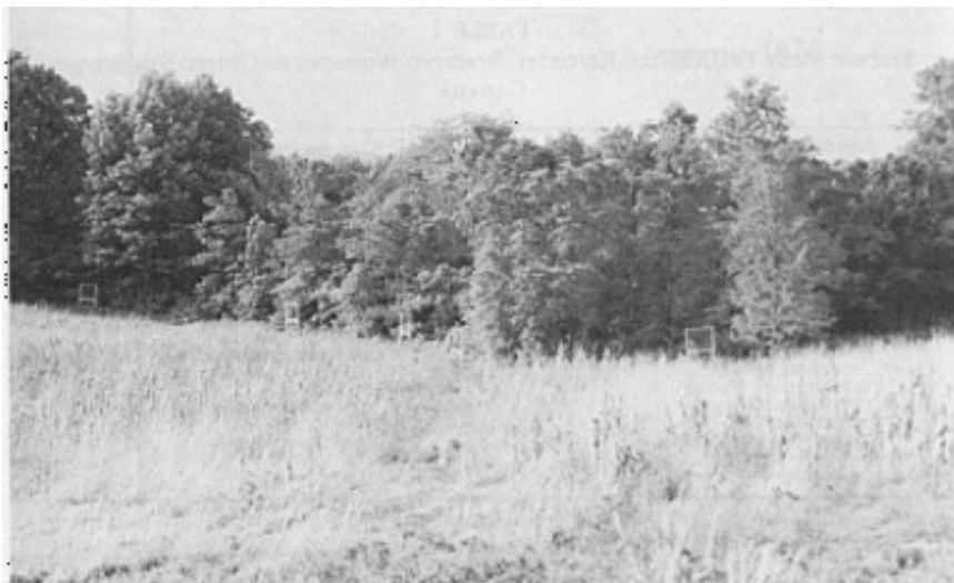
Fig. 1. Field experiment study site in Cobden, Union County, Illinois.